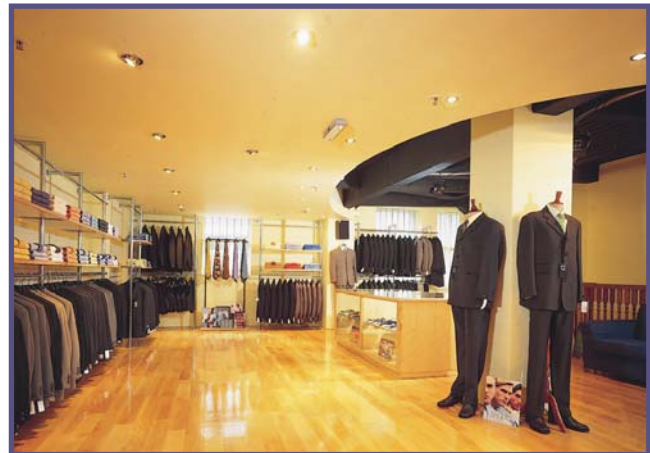
Comfort Cooling Applications